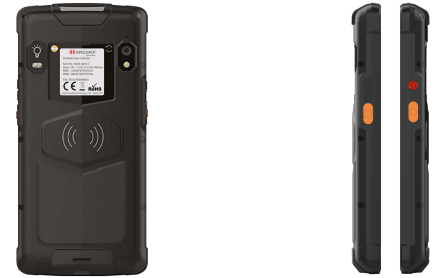
SD55L Lynx II Mobile Computer

Take your business to the next level with this rugged Android mobile computer.